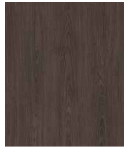
Mystic Dark Brown