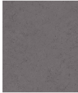
Basalt Dark Grey