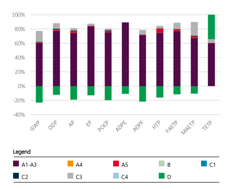
Figure 4 LCA results for the panel system

Figure 4 clearly indicates the relatively small contribution to each impact from the other life cycle stages, A4 and A5, and C1 through to C4. Of these stages, the most significant contributions are from stage A5 (installation of the product on the building), in the Human Toxicity (HTP) Potential indicator, and from stage C3 (waste processing) in the GWP, ODP and toxicity indicators. The A5 contributions to HTP are mainly from the manufacture of the stainless steel screws used to fix the panels to the building, while the C3 contributions are the result of emissions from the incineration for energy recovery of the foam insulation at end-of-life.