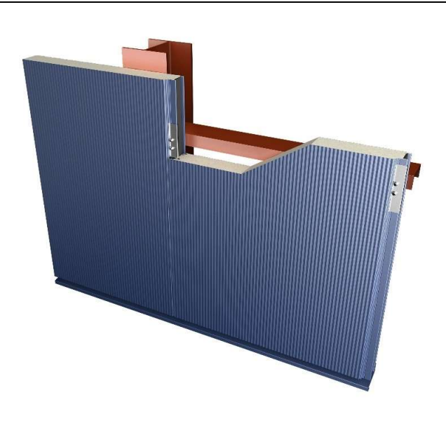
Figure 1 SAB WB 100.1000 wall panel system

The SAB W series and WB series wall systems are insulated panel systems comprising a pre-finished steel liner profile, a polyisocyanurate (PIR) insulation core, and a Colorcoat<sup>®</sup> pre-finished steel external weathering profile. The WB series has hidden fixings whereas for the W series of panels, the fixings are visible. Both panel types fall into category B-s2,d0 according to the EN 13501-1 standard <sup>[9]</sup> and also have Factory Mutual (FM) Approvals <sup>[10]</sup>. The SAB WB 100.1000 panel is shown in Figure 1