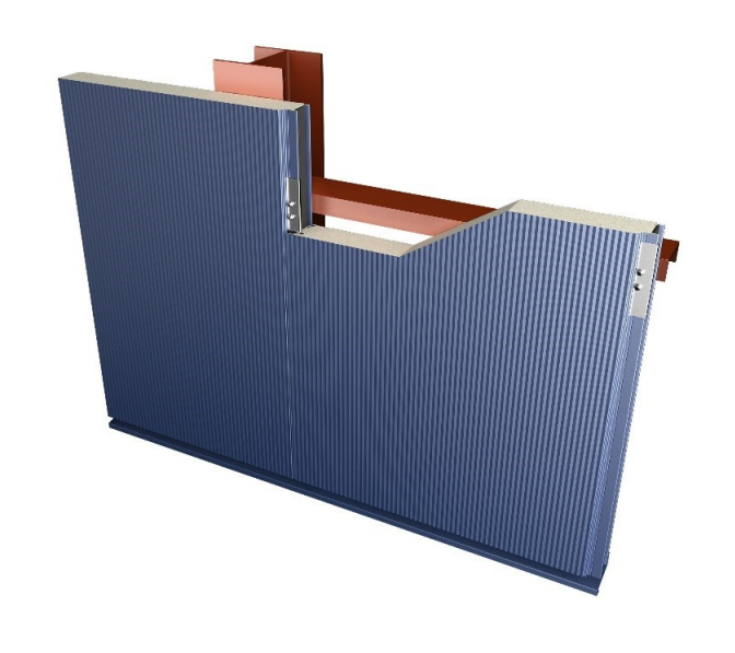
Figure 1 SAB WB 100.1000 wall panel system

The SAB WB 100.1000 wall system is an insulated panel system comprising a pre-finished steel liner profile, a polyisocyanurate (PIR) insulation core, and a Colorcoat® pre-finished steel external weathering profile. The panel, shown in Figure 1, falls into category B-s2,d0 according to the EN 13501-1 standard [8] and also has Factory Mutual (FM) Approvals [9].