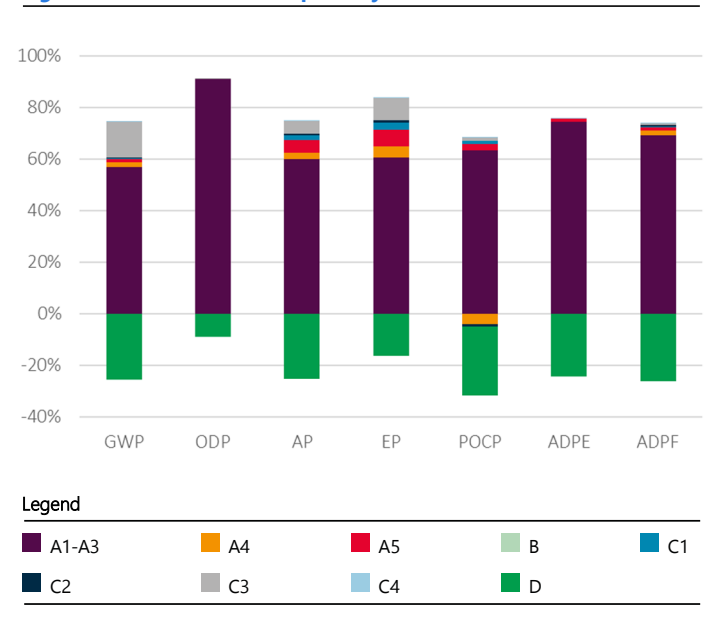
Figure 4 LCA results for the panel system

The impacts from the A4 and A5 stages are mainly the result of nitrogen oxides emissions from the combustion of diesel fuel used in road transport (A4) and to power site machinery such as fork lift trucks, scissor lifts and cherry pickers (A5). The emission of sulphur dioxide also contributes to the Acidification Potential indicator for A5, with approximately 20% of this impact coming from the manufacture of the stainless steel screws that fix the panels to the building.